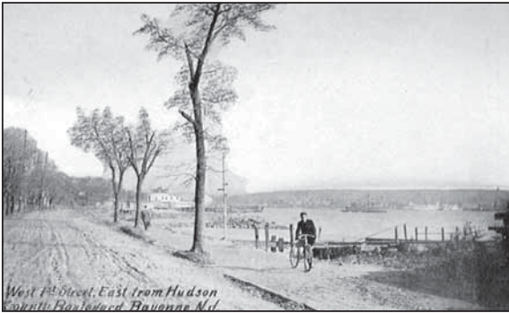
1 A bicyclist rides on the dirt roads of Bayonne.

A Few Rules From the League of American Wheelmen 1. Never expect pedestrians to get out of your way; find a way around them. 2. Never ride rapidly by an electric car [trolley] standing to unload passengers. 3. Never coast down a hill having cross streets along the way. 4. Do not ride too close to a novice [beginner], and in meeting a novice give plenty of room. 5. When riding after dark, always carry a lantern. Bicyclists were also cautioned to “remember the greatest enjoyment and benefit are had by moderate speed. You are not obliged to go fast simply because you can.”