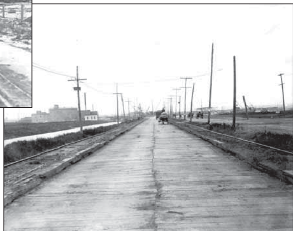
4 Right: In the same year wagons use a plank road (made of thick boards) in Kearny.