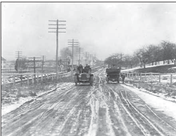
3 Above: These motorists travel “one of the better roadways of about 1910” in Newark. Notice the locomotive chugging along on the side of the road.