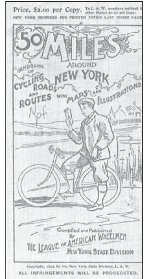
The League of American Wheelmen published this pamphlet in 1896. It supplied cyclists with detailed bike routes, some in New Jersey, and road rules.

In the early 20th century roads and highways were not only built but also maintained according to specific standards. Safety became a major concern. The need for road improvement was also linked to the fact that more and more people were driving cars and trucks. Because of vehicles many roads were now made of concrete and asphalt.