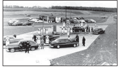
The East Brunswick Service Area in early 1952. Today the Turnpike’s 12 service areas are named for widely known Americans with New Jersey connections. This service area is now the site of the Joyce Kilmer Service Area. Do you know who he is and what his connection to New Jersey is?

November 5, 1951. The final section was opened on January 15, 1952. In all, the Turnpike ran 118 miles. Since 1951 the road has been lengthened and widened and extended. Today it runs 148 miles. The Turnpike was designed by hundreds of engineers and built by thousands of laborers. Today the day-to-day operations are handled by staff from administration, operations, engineering, maintenance, and toll collection. The Turnpike is supported by money earned from tolls and concessions. Construction projects are funded by revenue bonds. ★