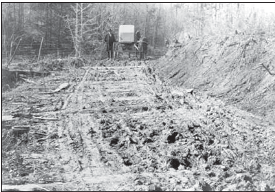
2 Although this corduroy road — made with logs and dirt — was in North Carolina, these roads were also found throughout New Jersey in the 1900s.

A Few Rules From the League of American Wheelmen 1. Never expect pedestrians to get out of your way; find a way around them. 2. Never ride rapidly by an electric car [trolley] standing to unload passengers. 3. Never coast down a hill having cross streets along the way. 4. Do not ride too close to a novice [beginner], and in meeting a novice give plenty of room. 5. When riding after dark, always carry a lantern. Bicyclists were also cautioned to “remember the greatest enjoyment and benefit are had by moderate speed. You are not obliged to go fast simply because you can.”