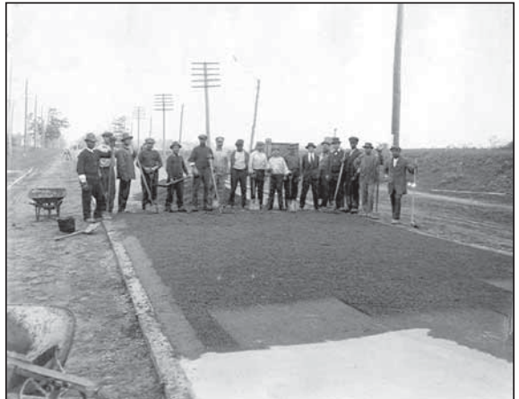
5 Can you tell what these Trenton workers are using to make a road? It doesn't appear to be logs or boards. (Collections of The New Jersey Historical Society)